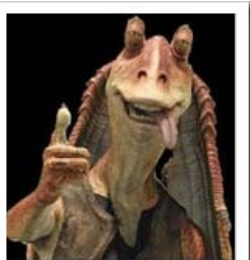
Seriously, George Lucas, WTF!?!?

One of the state reasons given yesterday for SB 5 is that the State of Ohio and local governments need to eliminate collective bargaining to help with the budget. Hogwash. The "budget" is become an excuse as a phantom menace for just about every ideological radical idea the Republicans are shoving down Ohio's throat. And like the "Phantom Menace", it is entirely predictable, disappointing, and a sign of even worst crap yet to come.